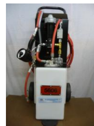
Landing Gear Servicing Unit