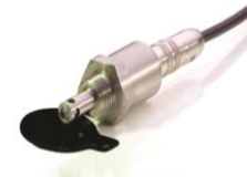
Intelligent oil condition sensors. A revolution in oil monitoring technology