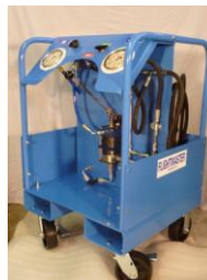
Cowl Pump & Thrust Reverser